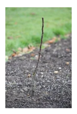
Winter pruned unfeathered maiden