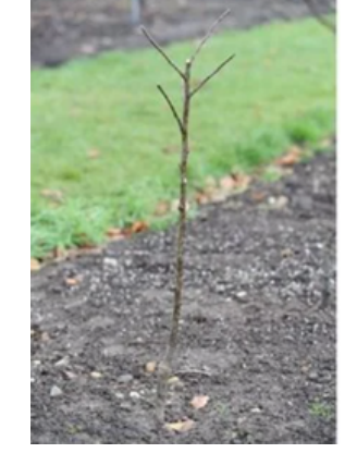
Winter pruned feathered maiden